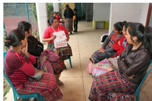
Lecture about family planning

At the end of 2020, we coordinated a family planning day with the organization ALAS from Guatemala, which presented and applied the IUD. The introduction was made to two women, but they were the only ones interested in the method. It is a little complicated to talk about family planning in our community, because of religious beliefs and other justifications women are afraid of the methods. Many women use some method of family planning, but sometimes in secret because their husbands or mothers-in-law don't want them to. In our community and in our country, it is important and urgent for women to plan because there are many children who suffer from malnutrition because couples have several children but have little economic resources.