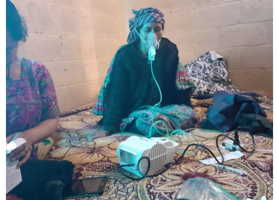
Visiting patients in Chocruz

In the first months of the year we received people with different health problems. When patients are in critical condition and cannot come to the clinic, we visit them at home to provide them with medical care and help them with what they need on the spot.