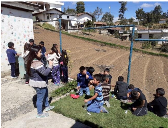
Brushing teeth with the children