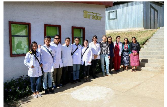
The team for the health day

In the month of March, we had a health day where several volunteer doctors from the city of Xela came to help in our community. Most people in the village have limited economic resources, so we planned this event. During the day, different examinations were offered, including: general examination, prenatal examination, gynecological examination, pediatric examination, family planning, among others. In this activity, many patients were received and people were grateful for the attention and support they received: the examinations were free and for the medications the minimum was charged, while the people who really could not pay for their medications received them for free. That day, we could welcome 30 patients who received medical care. In cooperation with the association ALAS from Guatemala, we were also able to organize a lecture on family planning methods. The women were very interested in the topic and so we ended our day, which was a great success.